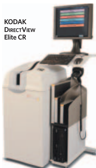
KODAK DIRECTVIEW Elite CR