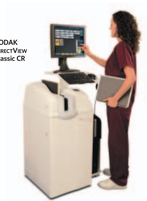
KODAK DIRECTVIEW Classic CR